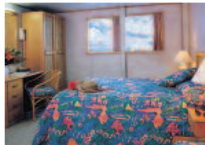
Category 2 Stateroom

The CORAL PRINCESS features an onboard marine biologist who enthusiastically shares his knowledge of and insight into the Great Barrier Reef's amazing array of marine life during excursions and lectures. The ship is also equipped with a special glass-bottom boat for viewing the wonders of the underwater universe in dry comfort.