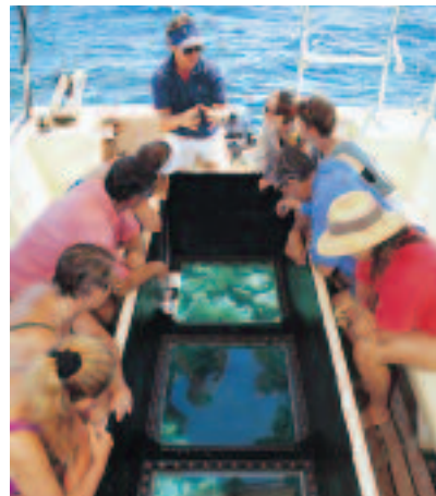
Marine biologist on glass-bottom boat