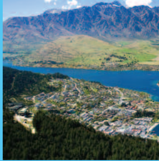
From Bob's Peak, enjoy panoramic views of deep blue Lake Wakatipu and the surrounding mountain range beyond it.

Words cannot describe the sublime beauty of Milford Sound, a spectacular fjord-like inlet where towering mountains plunge into the sea as countless waterfalls