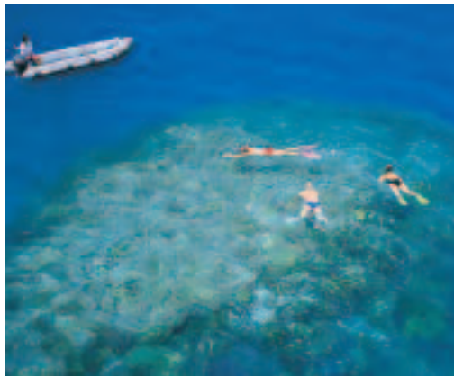
Snorkeling provides opportunities to see the stunning sights of the Great Barrier Reef up-close.