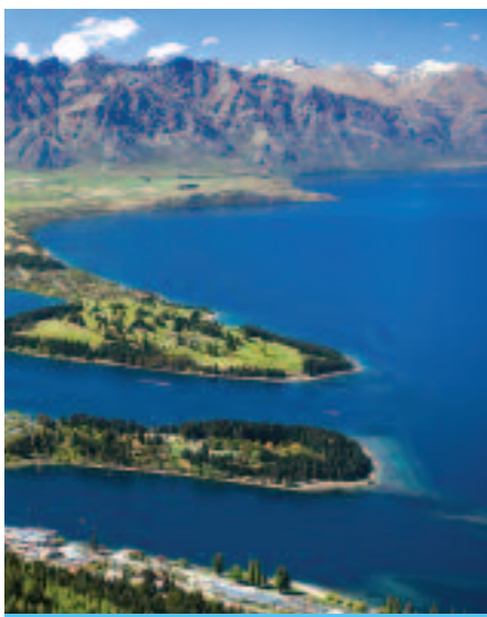
the Wakatipu and the aptly named Remarkables