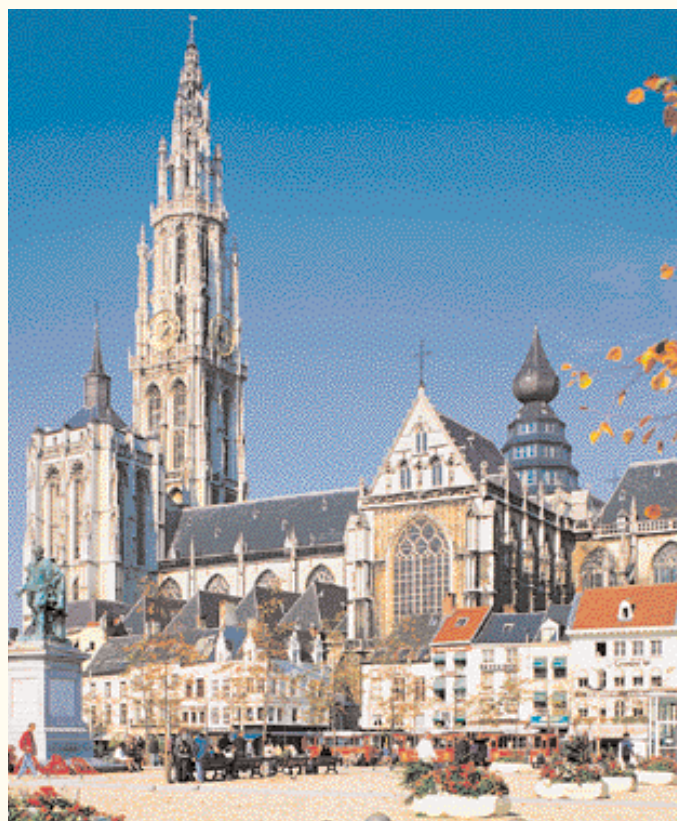
Antwerp Cathedral's majestic tower expresses the optimism of the Golden Age.

Bruges, one of the best preserved medieval towns in Europe, was built around a double ring of picturesque canals and is connected by arched foot bridges. The magnificent façades of the guildhalls and the famous octagonal belfry testify to the enormous wealth and power Bruges once possessed. Our private canal cruise explores Bruges' majestic townscape of treasured architecture, virtually untouched since the 15th century, from the very best perspective. Explore the Gothic churches, medieval guildhalls, historic Burg Square and lively Grand-Place Markt, the center of