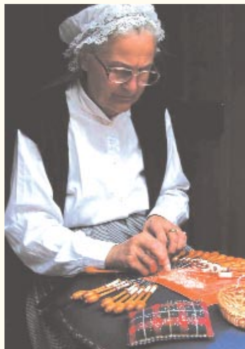
The traditional art of lacemaking still lives on in Bruges.

After 1,300 years, Ghent, the principal city of East Flanders, remains a prospering city full of vitality, history and charm. A visit to the Gothic St. Bavo's Cathedral, a majestic edifice built over the course of 600 years, features the 15th-century Altar of Ghent , a masterpiece of late medieval Flemish art painted by the brothers Hubert and Jan van Eyck. While cruising Ghent's canals, see innumerable architectural treasures including its city center, 14th- to 17th-century patrician houses, Gothic churches and historic Gravensteen, the castle of the Counts of Flanders.