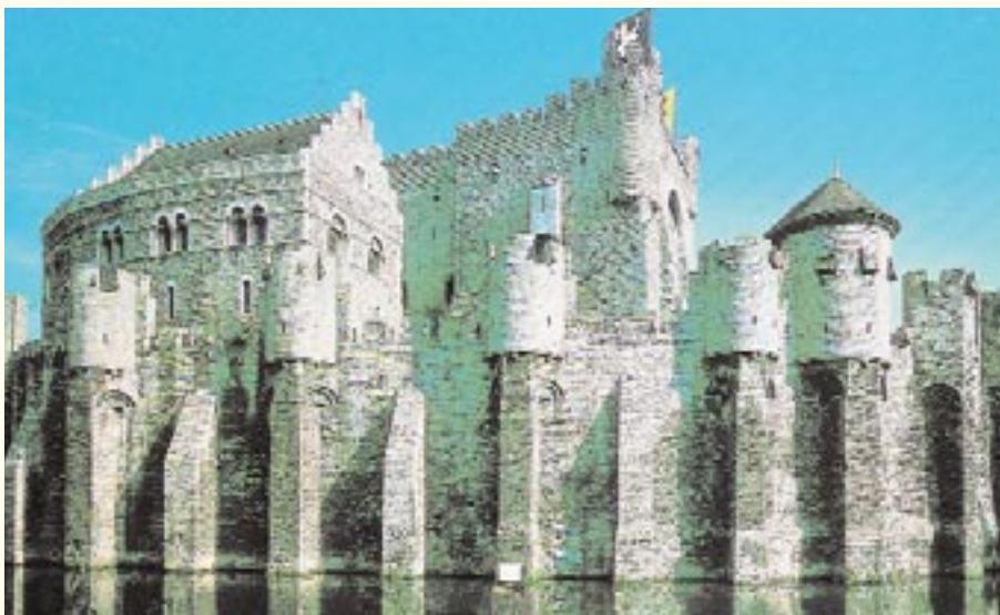
Ghent's imposing Gravensteen Castle once served as the seat of the Counts of Flanders.

Unpack once! This is an exceptional travel opportunity inclusive of accommodations, exclusively arranged excursions and most meals for an incredibly attractive price. Come experience a special way of life: VILLAGE LIFE IN MEDIEVAL BRUGES.