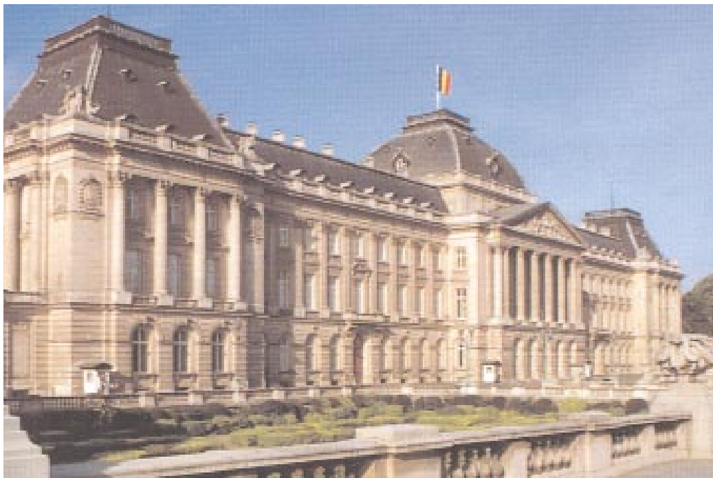
Since 1829, Brussels' Royal Palace has served as the residence of Belgium's monarchs.

*$2195 per person based on double occupancy (land only) †