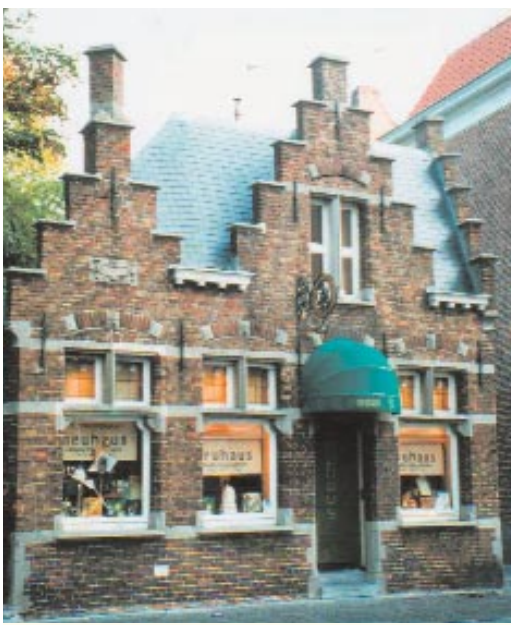
Belgium's chocolatiers produce the world's most savory confections.

architecture, and the 1890 birthplace of President Charles de Gaulle, commanding general of the Free French forces during World War II and president of France from 1959 to 1969. The Musée des Beaux-Arts, one of France's premier art museums, features an extensive collection of works by Flemish, French, Dutch, Italian and Spanish masters.