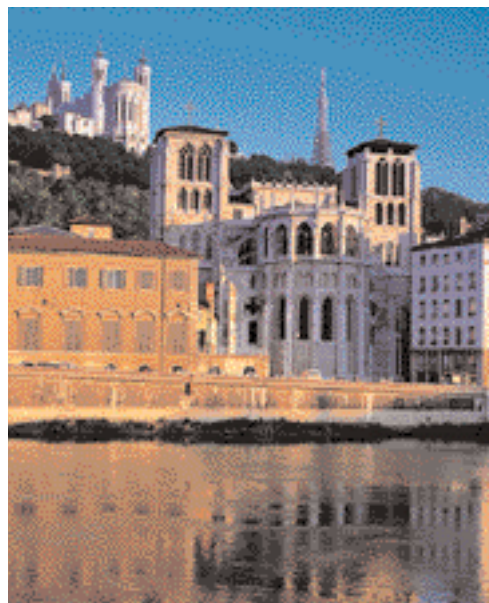
Lyon’s Cathédrale Saint-Jean and Basilique Fourvière, witnesses to the city’s long and often turbulent history.

In a country obsessed with food, Lyon occupies pride of place; known as the “capital of gastronomy,” it is where all France goes to eat. Deliciously rich Lyonnais cuisine, brightened by a bottle of Beaujolais, is served up at the city’s famed bouchons , neighborhood bistros with an unpretentious, convivial atmosphere. Situated at the confluence of the Rhône and Saône rivers, this hard-working city can be seen in all its Gallic red-roofed glory from the top of Fourvière Hill. Almost 300 Gothic and Renaissance mansions, built from the wealth of Lyon’s long-standing silk industry, grace Vieux Lyon.