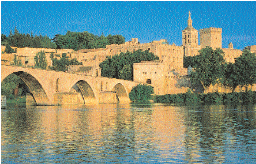
Gaze upon the imposing Papal Palace of Avignon, where nine popes resided during the 14th century's Great Schism.

Unpack once! This exceptional travel opportunity includes all accommodations, meals and exclusively arranged excursions for an incredibly low price. So, join us and experience a special way of life: Village Life in Burgundy and Provence .