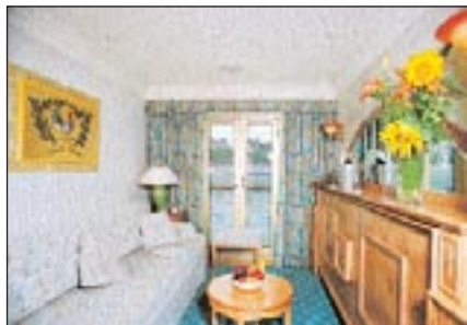
Cabin Category A