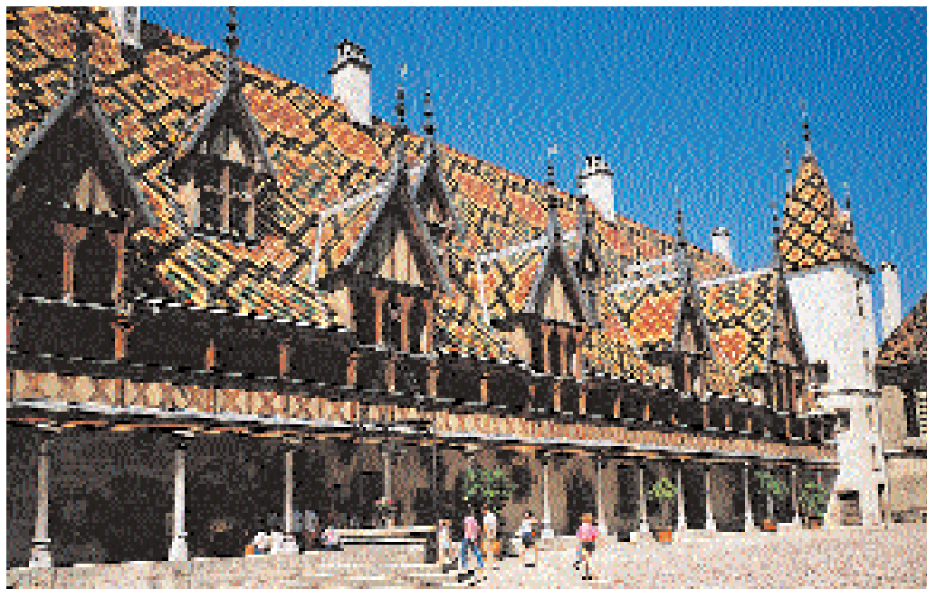
The myriad colors of the Hôtel-Dieu's roof tiles exemplify the character of Burgundy.

Situated amidst the vineyards of the Pouilly-Fuissé region, Cluny was one of the greatest centers of medieval Christianity. Indeed the immense influence exercised by the Cluniac Order on the religious, intellectual, political and artistic life of the Western World led Pope Urban II to tell its members in 1095, "You are the light of the world." Only a fraction of the 11th-century abbey complex remains, thanks to the Revolutionary upheavals of 1793, yet these beautiful and austere remnants still provide a fascinating glimpse of what was, until the construction of St. Peter's in Rome, the largest Christian basilica in the world.