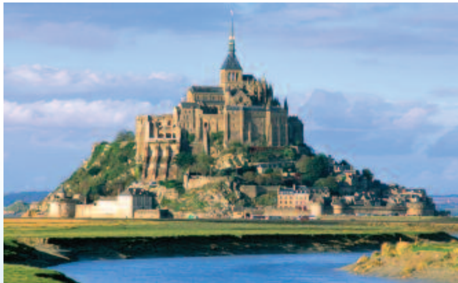
Soaring above the glistening waters of the English Channel and the wind-swept beaches of Normandy and Brittany, the sacred aura of Mont-St-Michel has drawn pilgrims from afar since the 8th century.