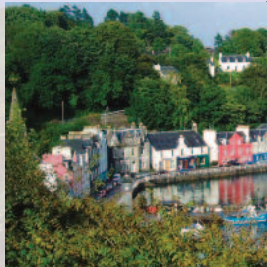
The traditional way of life in the Scottish Isles remains in the fishing port of Tobermory where brightly painted houses

From Holyhead, travel east by coach across the Isle of Anglesey and over the Menai Strait on your full-day tour of North Wales. Here, in one of the cradles of Celtic culture, people hold fast to the old ways, and Welsh remains their mother tongue. Visit Bodnant Garden, one of the finest examples of 19th-century Victorian landscape artistry. Continue to the nearby village of Betws-y-Coed for lunch and a stirring local choral performance of Welsh hymns. Visit the imposing Caernarfon Castle, an impregnable 13th-century fortress built by Edward I of England. In 1969, the castle served as the investiture site for the Prince of Wales. View the Snowdonia Mountains—a land of glacier-sculpted peaks and valleys, laced by streams and waterfalls that cover the hillsides—en route to the ship.