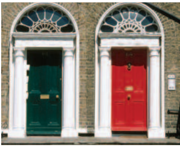
Many of Dublin's elegant Georgian homes are distinguished by their colorfully painted doors.