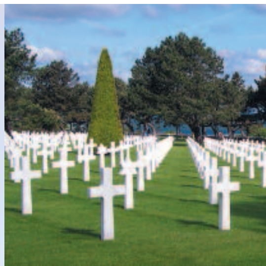
The American Military Cemetery at St-Laurent, France, honors those who made the ultimate sacrifice during the D-Day landings, spearheaded the liberation of France from Nazi occupation in the summer of 1944.

This afternoon, set out on a scenic coastal drive to historic Derry, Northern Ireland's second largest city and the only remaining walled town in the British Isles. During the city tour, visit the 17th-century St. Columb's Cathedral, a classic example of "Planters' Gothic" architecture and the first cathedral built in Ireland following the Reformation. Learn more about Derry's role in Irish history at the Tower Museum, where exhibits chronicle landmark events from the Battle of the Boyne and the defeat of the Spanish