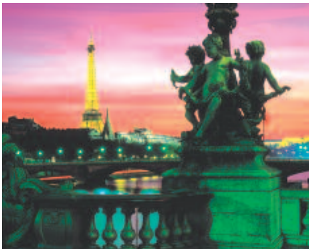
The radiant Eiffel tower and graceful Parisian architecture stand beside the Seine River as it flows through the "City of Lights."

Upon disembarkation in Honfleur, extend your program with an optional two-night stay in Paris, featuring first-class accommodations in the Hotel Ambassador , located near the Opera and the Rue de la Paix. During a half-day orientation tour, view Notre Dame, the Eiffel Tower, and the Arc de Triomphe, and admire the artistry of French, Dutch and Italian masters in the Musée Jacquemart-André, housed in an elegant former mansion. Ample time at leisure affords you opportunities to explore Paris' museums and galleries, stroll the tree-lined Champs-Élysées, or savor the glories of French cuisine in a five-star restaurant. Complete details will be included with your reservation confirmation.