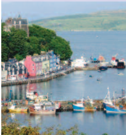
changed by the passage of centuries in the colorful overlook the Sound of Mull.

the village lead up to the graceful abbey church and cloisters that rise high above the sea. Visit the Romanesque and Gothic abbeys, and walk through the tranquil cloister and vaulted scriptorium, where monks once copied manuscripts.