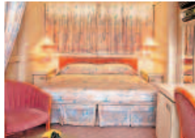
Category 1 Stateroom

All 113 spacious, outside staterooms or suites (ranging in size from 183 sq. ft. to 398 sq. ft.) are tastefully appointed and feature two lower twin beds that convert to one queen-size bed upon request, a private bathroom with shower (some staterooms have bathtubs and showers), telephone, television, DVD, minibar, double full-length closets, two nightstands, desk, hairdryer, duvets and plush terry cloth robes. Room service is available.