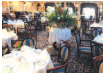
L'Escapade Dining Room

Continental breakfast, buffet breakfast, buffet lunch, afternoon tea and dinner are served daily in a single, unassigned seating. The Restaurant Îles de France offers innovative Continental fare in a relaxed, inviting setting. Guests may reserve a table at L'Escapade restaurant for more intimate evening dining. Complimentary house wine, beer, soft drinks, mineral water, coffee and tea are served at lunch and dinner.