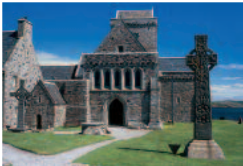
Scotland's past lives on in Iona's Abbey, the burial site of medieval kings.

PRSR STD U.S. Postage PAID Gohagan & Company