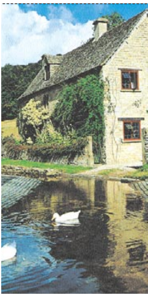
Ducks enjoy a summer swim in Chipping Campden.

PRSRT STD U.S. Postage PAID Gohagan & Company