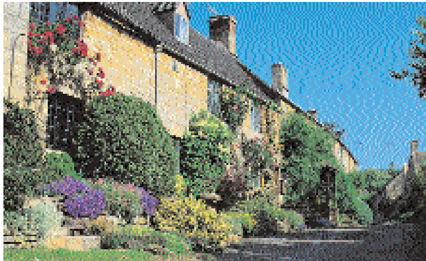
Golden stone and flowering trees bedeck many of Cheltenham Spa's homes.

Unpack once! This is an exceptional travel opportunity inclusive of all airfare, accommodations, meals and exclusively arranged excursions for an incredibly low price . Come experience the special way of life: Village Life in England's Cotswolds .