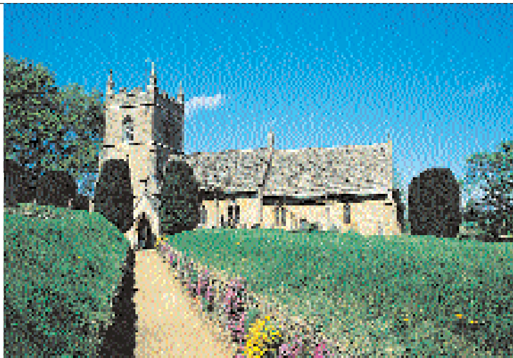
Travel to quiet stone churches, like this one near the town of Chipping Campden.

$2595 per person based on double occupancy (from New York). *