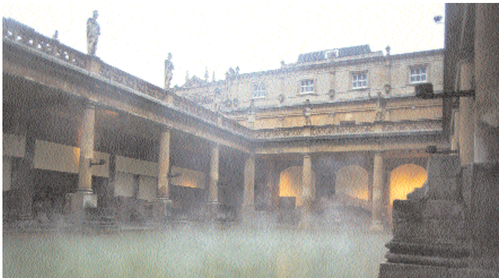
In Bath, see a spectacle of Roman ruins, Gothic and Regency splendor—all in the same place.

Almost impossibly picturesque, the Cotswold villages of Stow-on-the-Wold and Chipping Campden still embrace a time before the soot and sound of the Industrial Revolution. Stow-on-the-Wold , the highest Cotswold town with a