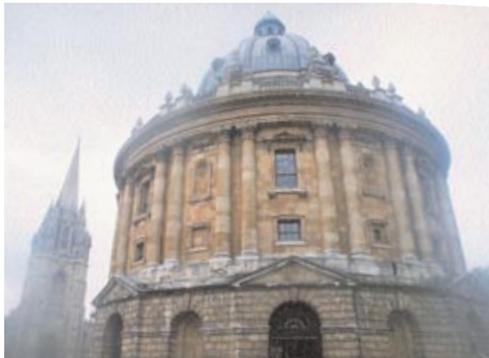
The Radcliffe Camera, with the University Church of St. Mary's behind it, are but two of the 700 historic buildings of Oxford University.