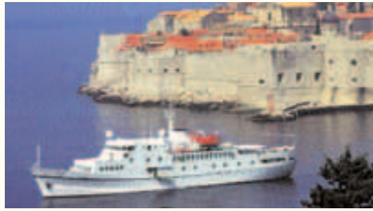
The M.Y. MONET just outside the walled city of Dubrovnik.

The intimate M.Y. MONET is a 31-cabin vessel, tastefully appointed with an inviting and informal atmosphere. Specially designed to enter smaller ports and inlets, this ship offers an authentic coastal cruising experience.