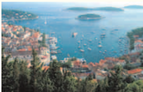
The splendid island port of Hvar was an important stop on trade routes between Venice and the Orient.