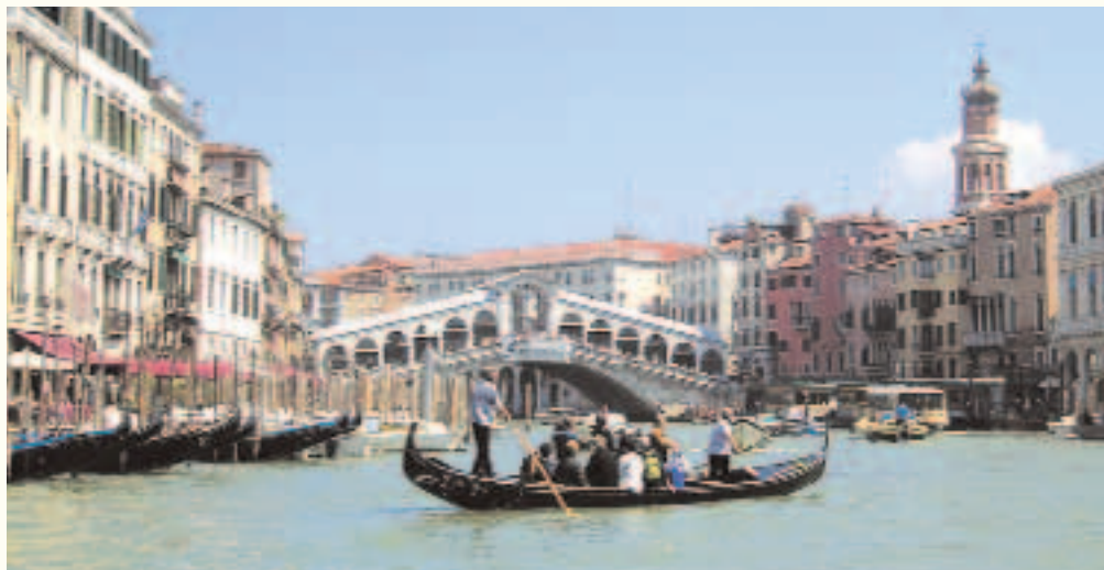
Venice's signature gondolas provide a unique perspective for viewing the city's many architectural treasures, including romantic Ponte di Rialto.

Located near the tip of a narrow limestone island off the Dalmatian Coast, Hvar traces its foundation to settlers from Sicily in the fourth century B.C. In subsequent eras, Romans, Byzantines, Croats and Venetians all left their mark on its history and architecture. The 15th-century Franciscan monastery and the nearby Church of Our Lady of Charity house artworks reflecting the city’s dual Slavic and Italian heritage. Within Hvar’s picturesque walled old town, the Renaissance Cathedral of St. Stephen and its Italianate bell tower rise above the bustling Main Square.