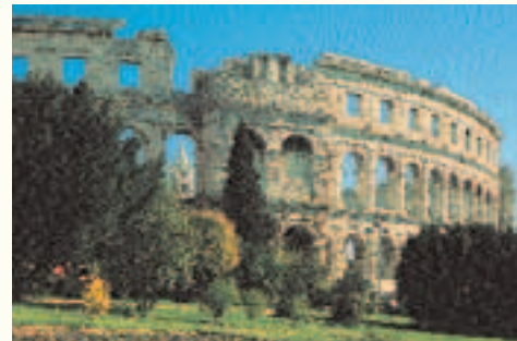
Pula’s Roman Arena is second only to Rome’s Colosseum in grandeur.

Located astride a narrow peninsula, the historic city of Zadar can justly lay claim to the title of spiritual capital of Croatia. Within the walls of its old town, its beautifully preserved churches and chapels reflect 1,200 years of changing styles in ecclesiastical architecture. The ninth-century Church of St. Donatus, with its conical-cylindrical dome, stands as Dalmatia’s finest Byzantine legacy. Built on the site of Zadar’s ancient Forum, the Cathedral of St. Anastasia’s austere Romanesque façade contrasts dramatically with its ornate Baroque interior. The Museum of Sacred Art, located in a former monastery, houses a priceless collection of religious paintings and artifacts.