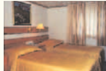
Cabin Category 3

The M.Y. MONET's English-speaking Croatian crew provides courteous, professional service.