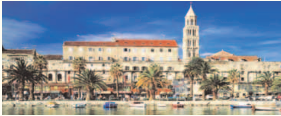
Seventeen centuries ago, Roman galleons anchored in the scenic harbor of Split.