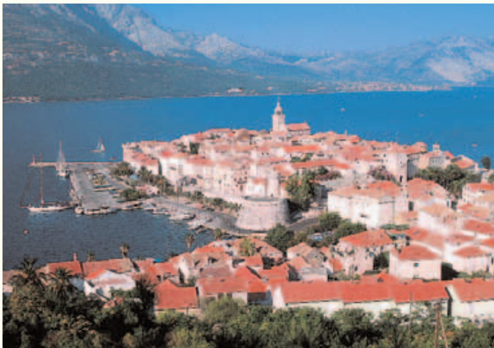
Explore the finely preserved medieval port of Korčula, birthplace of the great explorer Marco Polo.

Unpack once! This is an exceptional travel opportunity inclusive of all accommodations, meals and exclusively arranged excursions for an incredibly attractive price. Come experience a special way of life: VILLAGE LIFE ALONG THE DALMATIAN COAST.