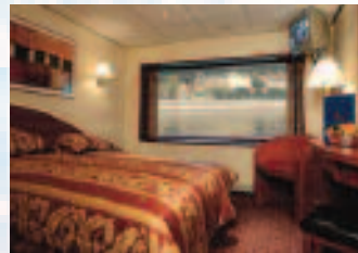
Stateroom Category 1

The M.S. AMADEUS SYMPHONY'S highly qualified European crew affords participants an unmatched level of service distinguished by professionalism, efficiency and personal attention. The ship also meets the highest international safety and environmental standards.