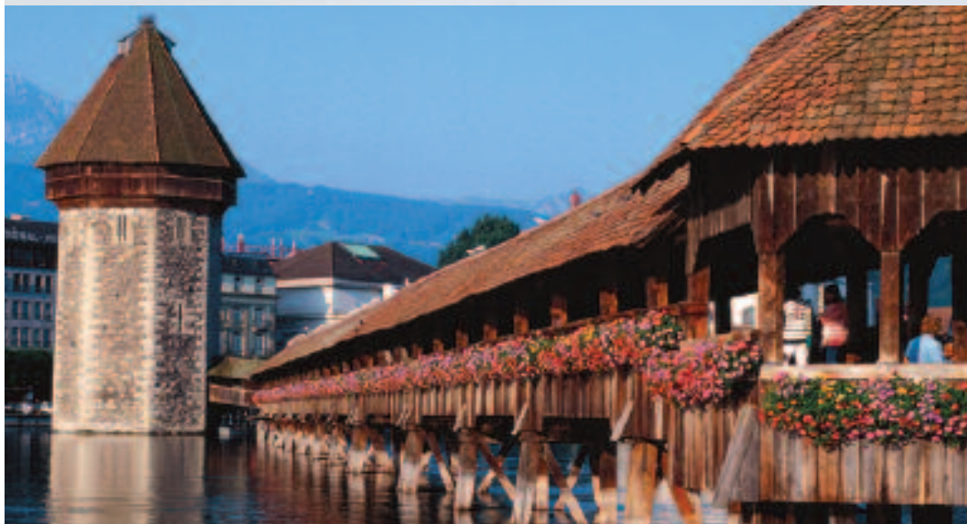
Alpine flowers adorn the railing of Lucerne's 14th-century Kapellbrücke, Europe's oldest covered wooden bridge, which features a famous painting on its roof's interior of William Tell shooting the apple from his son's head.

Dock this afternoon in Koblenz, a link to Germany's Roman past. Established in nine B.C. during the reign of Augustus Caesar, it occupies a strategic location at the confluence of the Rhine and Moselle rivers. From the Deutsches Eck (German Corner), where the two rivers meet, enjoy a view of the impressive 17th-century fortress of Ehrenbreitstein on the opposite bank of the Rhine, once the residence of the powerful Archbishop-Electors of Trier. The twin-towered Basilica of St. Castor, built between the 11th and 13th centuries, embodies the Rhineland's distinctive style of Romanesque architecture. Depart Koblenz this evening.