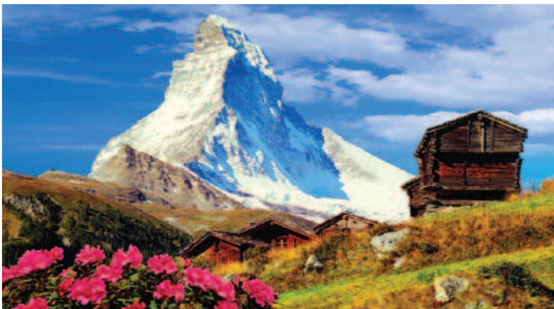
The unmistakable profile of the Matterhorn's dramatic ice-sculpted summit presents an image of alpine splendor and majesty that has inspired poets and artists for centuries.