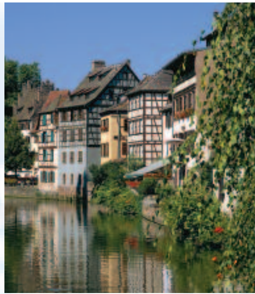
Half-timbered houses in Strasbourg's Petite-France quarter reflect the city's dual French and German character.

which belies a lavishly adorned interior. Visit imposing Heidelberg Castle, once the residence of the Counts Palatine of the Holy Roman Empire. Damaged during the Thirty Years' War (1618-48) and a subsequent French invasion, the stately ruins preserve Heidelberg's links with its medieval past.