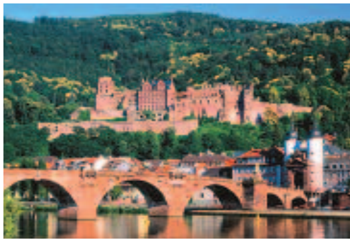
The romance of a bygone era still lives in Heidelberg, whose medieval castle rises above the Old Town and the 18th-century Alte Brücke.