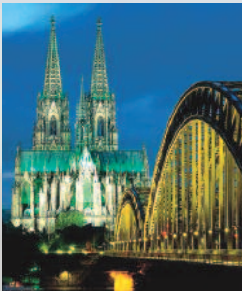
Towering spires crown Cologne's majestic Cathedral, one of the finest Gothic structures ever built.

In Mannheim, board a motorcoach and set out for the university town of Heidelberg. Nestled in the wooded valley of the Neckar River, Heidelberg emerged largely unscathed from World War II and has preserved its Renaissance-Baroque character. The nine arches of the Alte Brücke (Old Bridge) span the Neckar. Walk through the heart of the Old Town and view the Late Gothic Church of the Holy Spirit, built from locally quarried red sandstone; the Knight's House, an elegant 16th-century mansion representative of the German Mannerist style; and the austere façade of the 18th-century Jesuit Church,