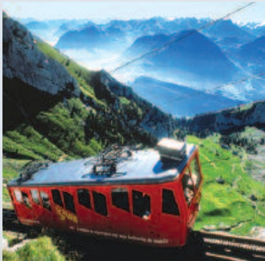
Ride aboard the Pilatus Bahn , which incorporated a groundbreaking design and became the world's steepest cog railroad upon its completion in 1889.

No feat, however, required greater skill and determination than the laying of the track for the Glacier Express . On June 20, 1930, the Swiss Federal Railways inaugurated service across Europe's rugged mountain spine—the towering Alps. Over the ensuing three quarters of a century, travelers have enjoyed this scenic, leisurely journey. Sleek, modern carriages glide along the track linking Zermatt, dramatically located against the distinctive pyramidal backdrop of the Matterhorn, to the forested heart of Switzerland and the world-famous destination of St. Moritz. The rail route represents a triumph of engineering ingenuity—the nine-and-one-half-mile-long Furka Tunnel penetrates the mountainous barrier separating the cantons of Valais and Uri, and arched stone bridges span the tumbling headwaters of two of the continent's greatest rivers, the Rhône and the Rhine.