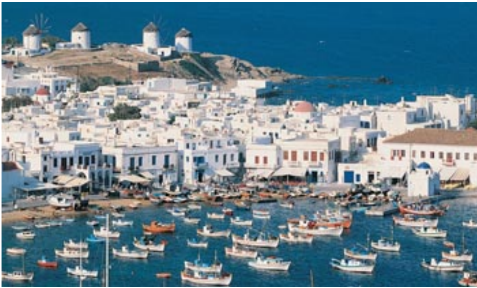
Experience the timeless traditions and scenery of the Greek Isles in ancient fishing ports like Mykonos where the ways of the past intertwine with life in the present.