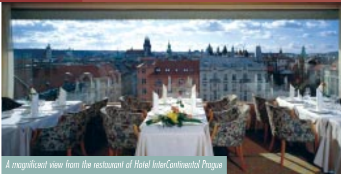
A magnificent view from the restaurant of Hotel InterContinental Prague

Also find a full fitness center, with indoor swimming pool, sauna, massage, solarium, cardiovascular machines, and free weights.