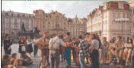
Listen to the music of street buskers in Prague's Old Town Square.