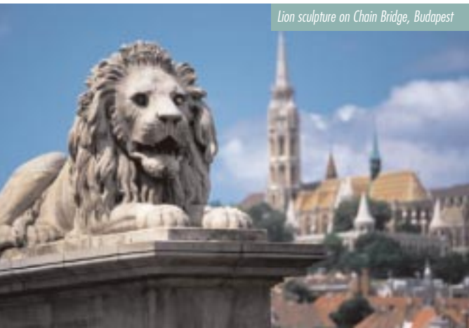
Lion sculpture on Chain Bridge, Budapest

DAY 4 Budapest (Pest tour) Pest — the city's urban heart — is full of landmarks, plus innumerable tiny