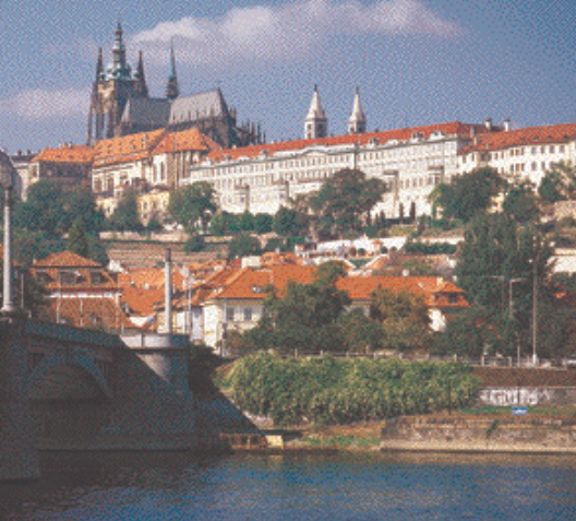
The Vltava River flows past majestic Prague.