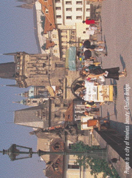
Prague is a city of timeless beauty. Charles Bridge.