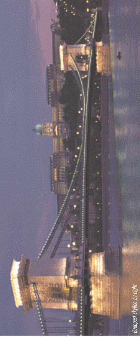
Budapest skyline by night

Designed as a themed, quick getaway, this “delightful jaunt for those pressed for time” is an excellent occasion for in-depth learning and discovery, exploring the historic capitals of Hungary and the Czech Republic — two jewels at Europe’s core that gracefully reflect the Continent’s rich cultural heritage of art, architecture, music, literature, and fine food. Casual and unregimented, this unique and innovative itinerary — custom-designed by INTRAV — has an intimate ambience that is conducive to camaraderie and shared experiences. Join us for a journey that is short in duration, but filled with meaningful encounters — European Jewels!