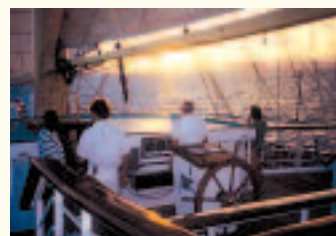
View from the sundeck