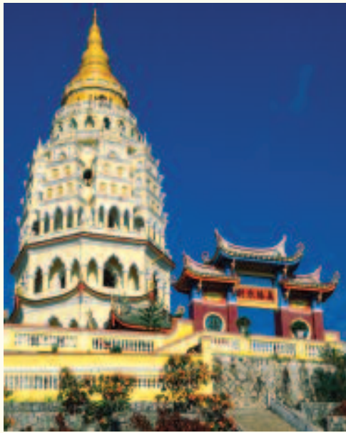
Mahayana Buddhism and traditional Chinese ritual blend harmoniously in the architecture and artwork of Georgetown's Kek Lok So Temple.

the island's fabled kapi shrimp paste, prized by chefs across Thailand.