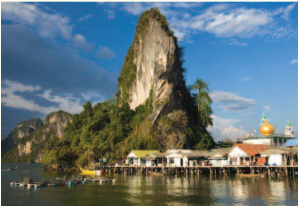
The small fishing village Koh Panyi is an architectural wonder, built entirely on stilts in the shallow waters of the Phang Nga Bay.

Come experience a special way of life: COASTAL LIFE: CRUISING THAILAND AND THE MALAY PENINSULA.