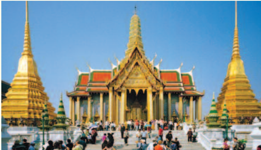
Bangkok's historic Grand Palace complex houses the famous temples of the Emerald Buddha and the Reclining Buddha.

The ethereal seascape of multi-hued limestone mountains rising like giant natural skyscrapers from the emerald waters of Phang Nga Bay constitutes one of the most surreal and unforgettable sights in all of Asia. Formed by slow-flowing glaciers millions of years ago, the area's highly distinct karst formations and limestone outcroppings are riddled with innumerable hidden coves, inlets and caves, many of which have been festooned with paintings or converted into Buddhist monasteries. The most famous of these is the rocky pinnacle of Ko Tapu, which dramatically juts toward the sky like a solitary pillar from the waters off Ko Pinggan. On the nearby island of Ko Panyi, Indonesian “sea gypsies” settled in the 18th century and built an entire village on stilts over the water at the foot of the island's limestone hills. Today, the villagers are known for their warm hospitality and exquisite seafood, and can be seen hauling the day's catch from their longtail boats and making