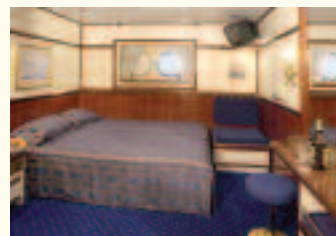
Cabin Category D