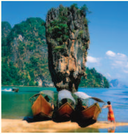
Traditional long-tail boats cruise emerald green waters surrounding the limestone formations of Koh Ping-gan.

PRSR STD U.S. Postage PAID Gohagan & Company