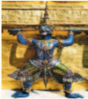
Thai artistry and craftsmanship are appreciated the world over.

Gain an insider's perspective into coastal life in Southeast Asia while participating in a stimulating VILLAGE FORUM with local residents and learn more about the region's rich spiritual traditions during specially arranged excursions to ancient temples and pagodas.