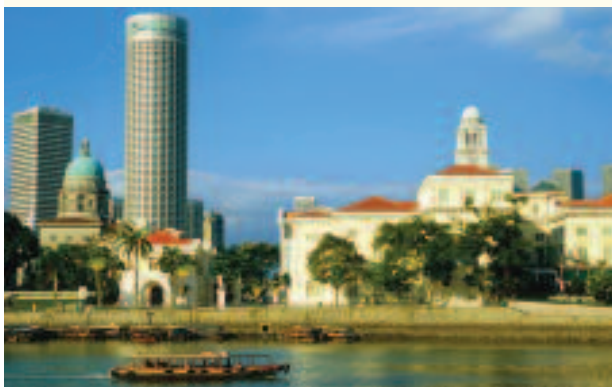
Admire Singapore's skyline of architecture that ranges from colonial period buildings to striking modern skyscrapers.

Extend your stay in the multicultural city-state of Singapore by joining this exclusive Post-Program Option and spend two nights in one of the world's most diverse and cosmopolitan centers. Immerse yourself in this one-of-a-kind city's unique legacy as a repository of Chinese, Malay and Indian cultures; enjoy its exquisite culinary offerings and learn more about how it has transformed itself from a backwater fishing port into one of the world's most prosperous and dynamic cities in a matter of generations. Specially arranged excursions and accommodations in a centrally located deluxe hotel are included. Complete details will be provided with your reservation confirmation.