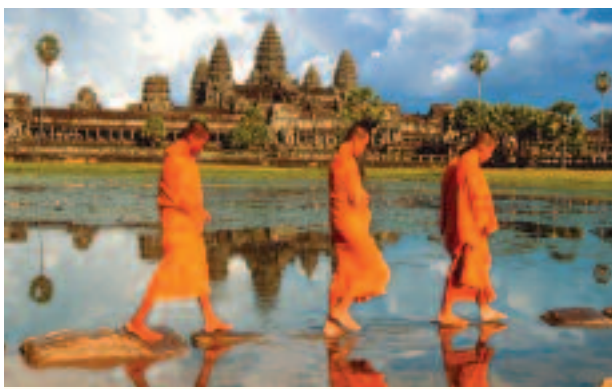
Visit the temples of Angkor, which number more than 1,000 and include Angkor Wat, the world's largest religious monument.