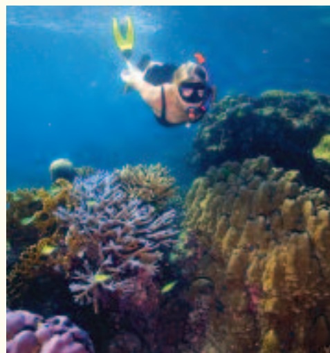
Snorkelers discover another world under the water among the coral reefs of the remote Similan Islands.

Forged by the visions of Sir Thomas Stamford Raffles and Lee Kwan Yew, combined with the toil and entrepreneurship of immigrants from China, Malaya and India, Singapore has been transformed in less than two centuries from a small backwater village on the Straits of Malacca into the world's busiest container port and a cosmopolitan center of international finance and trade. Yet, while glittering skyscrapers and opulent shopping centers stand as testaments to this polyglot city's stunning prosperity, its ethnic roots and immigrant soul proudly live on in the teahouses of Chinatown, the markets of Arab Street and the colorful bazaars of Little India on Serangoon Road.