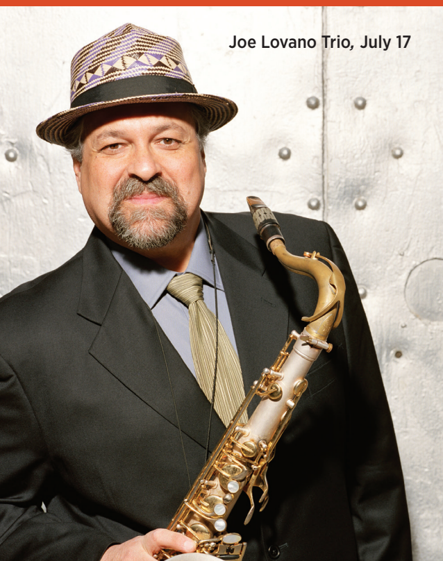
Joe Lovano Trio, July 17

WESLEYAN UNIVERSITY MIDDLETOWN, CT www.wesleyan.edu/cfa