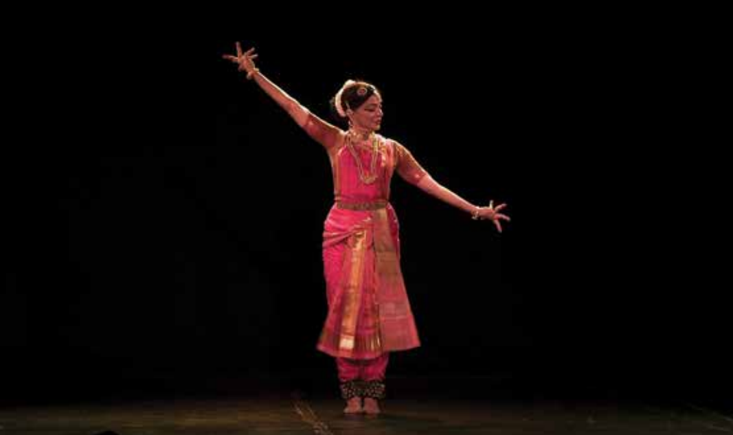
Malavika Sarukkai (September 27 & 28)