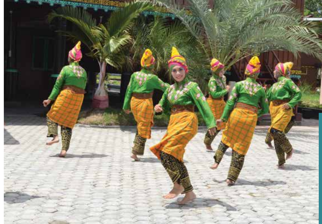
Tari Aceh! (February 27, 2015)