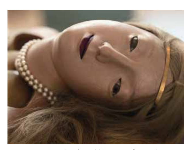
Tanya Marcuse (American, born 1964), Wax Bodies No. 187 , 2007, pigment print.

The exhibition Phantom Bodies brings together Undergarments and Armor (2002–2004) and Wax Bodies (2006–2008), two projects in which Tanya Marcuse creates haunting photographs evoking absent bodies. For Undergarments and Armor , Ms. Marcuse traveled to archives and museums in the United States and England. For Wax Bodies , she photographed the 18th-century Italian anatomical models in two obscure museum collections, La Specola in Florence and the Josephinum in Vienna.