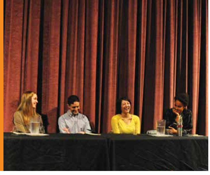
Theater After Wesleyan panelists from 2012.