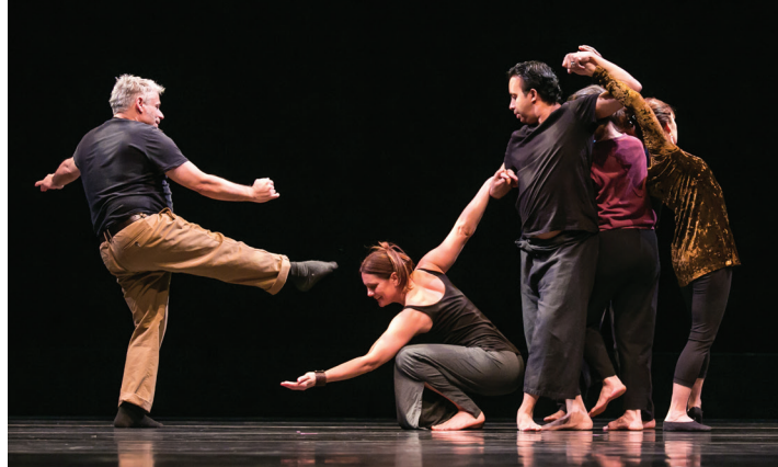
Fall Faculty Dance Concert (October 26 and 27)