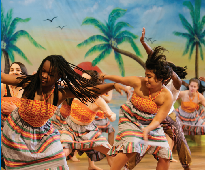
West African Drumming and Dance Concert (December 8)