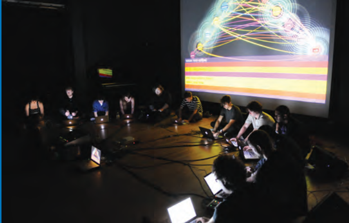
Toneburst Sampler Concert (March 5)