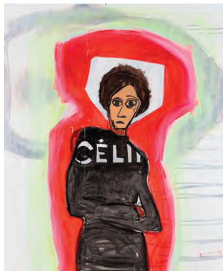
Liz Markus, Celine , 2016, Acrylic on canvas, 72 x 60 inches.

The Center for Creative Youth is a four-week pre-college summer residential program run by the Capitol Region Education Council and hosted on the Wesleyan University campus for teenagers ages 13 to 18 to focus on intensive study in the arts. Founded in 1976, the program features daily classes in creative writing, dance, filmmaking, music, musical theater, photography, theater, and visual arts. Students experience master classes and performances by visiting artists, field trips, dances, open mic nights, and opportunities to share what they have learned with the community. Students gain hands-on experience in the arts as part of an advanced, progressive curriculum emphasizing critical thinking, interdisciplinary and multicultural learning, leadership skills, and historical context. Applicants must have completed at least one year of high school to be eligible for the program. Applications are accepted on a rolling basis until program is filled, with notification sent by April 4, 2018. For more information and to apply, please visit www.crec.org/ccy .