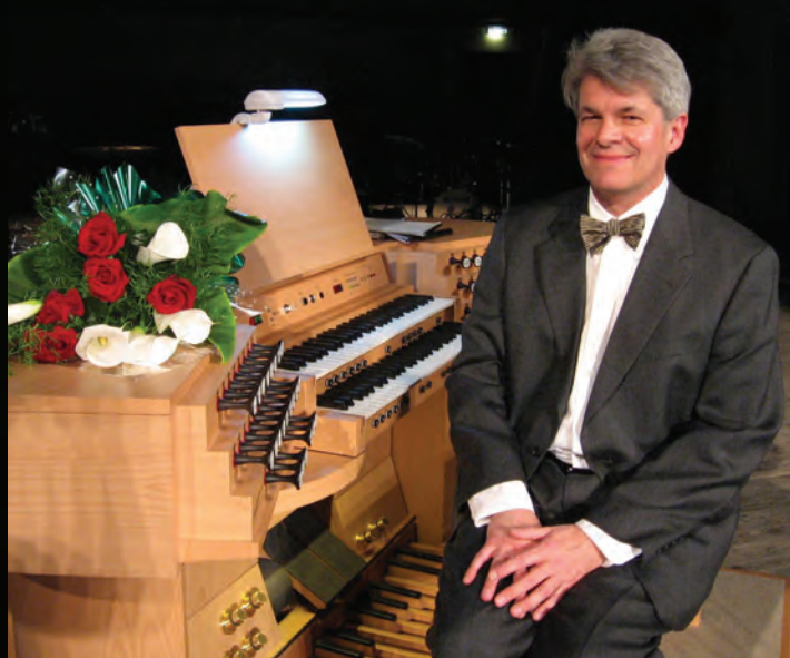
Annual Organ Romp (May 9)