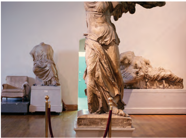
Louise Lawler, A.C.A.D.E.M.Y. , 1987, Silver dye bleach print, 29 x 39 1/2 inches, 73.7 x 100.3 cm, (MP# LL-207).