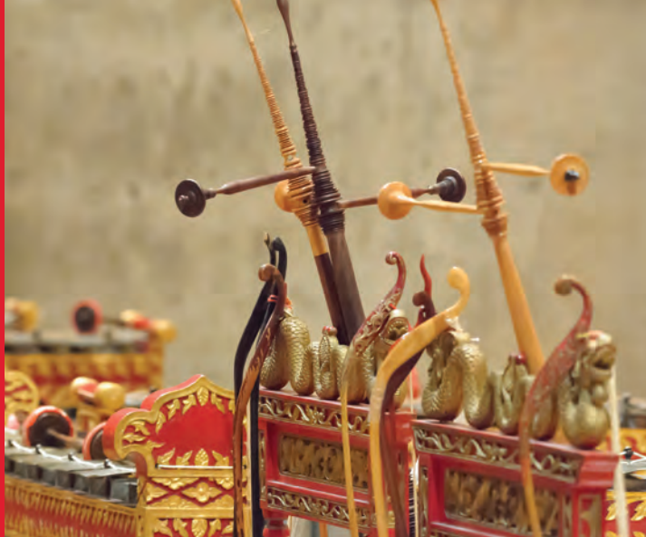
Javanese Gamelan (April 11, 25, and May 2)