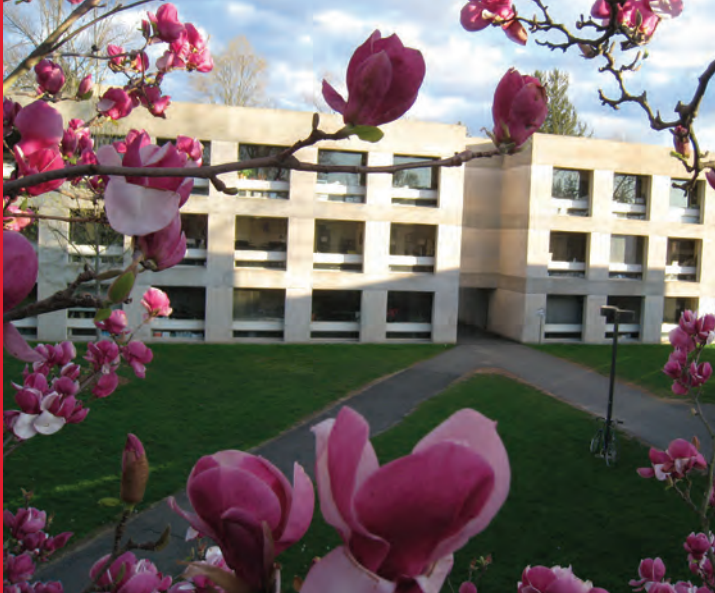
Music Studios at the Center for the Arts, designed by Kevin Roche