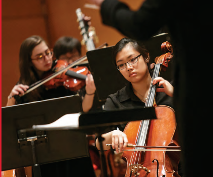
Wesleyan University Orchestra (March 3 and May 4)