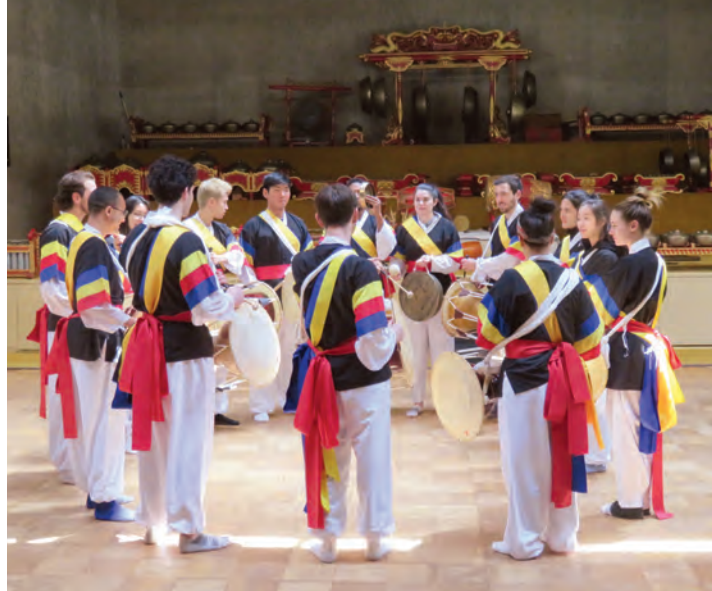
Korean Drumming and Creative Music Ensemble (April 11 and 24)