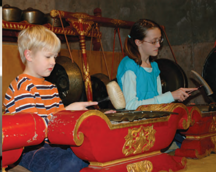
Wesleyan Youth Gamelan Ensemble

Applications are due Tuesday, January 15, 2019 for the academic year beginning July 2019. For more information and to apply: www.wesleyan.edu/icpp