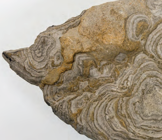
Stromatolite, Hoyt Limestone, Saratoga Springs, New York, Late Cambrian (~490 million years old). Courtesy of the Joe Webb Peoples Museum and Collections, Wesleyan University.