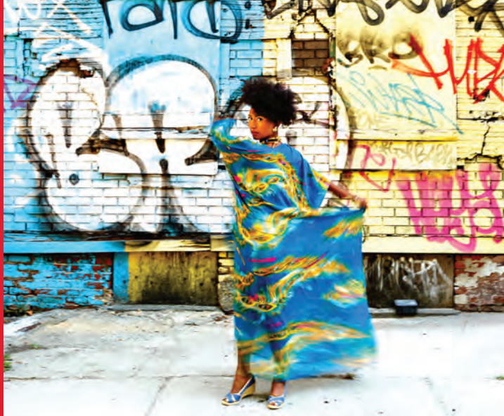
Alsarah and The Nubatones (March 29)