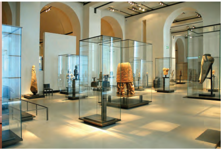
Le musée du Quai Branly au palais du Louvre, Pavillon des Sessions, 2009.