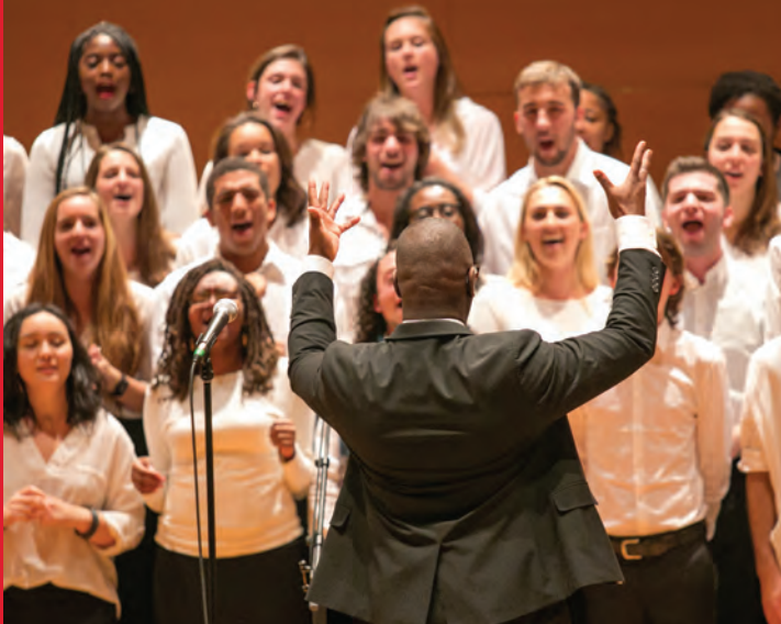
Ebony Singers (April 29)