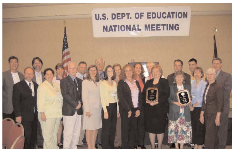
The U.S. Department of Education's Alcohol and Other Drug Prevention Models on College Campuses 2005 grant competition awardees