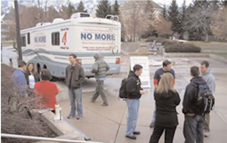
2005–06 National Peer Educator Tour

T wenty colleges and universities make up the 2005 cohort of grantees from the U.S. Department of Education's competition for Grants to Prevent High-Risk Drinking or Violent Behavior Among College Students. Grantees receive funds to develop or enhance, implement, and evaluate campus- and/or community-based prevention and early intervention strategies to prevent high-risk drinking, drug abuse, or violent behavior among college students.