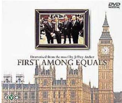
First Among Equals A TV drama series based on the novel by Jeffery Archer

The lecture occasionally uses excerpts from the following audio-visual materials. Each showing will not exceed 10 minutes.