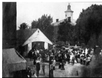
Slave sale in Maryland

However, the Transatlantic slave trade from Africa to the Americas had been around for over a century already, originating around 1500, during the early period of European discovery of West Africa and the establishment of Atlantic colonies in the Caribbean and South and North America when growing sugar cane (and a few other crops) was found to be a lucrative enterprise. Slaves were usually captured by African tribes in raids or open warfare or purchased from other African tribes. Many tribes were happy to get rid of their enemies by capturing and selling them for trade goods--usually whiskey, swords, guns and gold. It is believed that about 11 million men, women and children were transported in ships across the Atlantic to various ports in the Americas, mostly to Brazil and the islands in the Caribbean from 1500 to 1850.